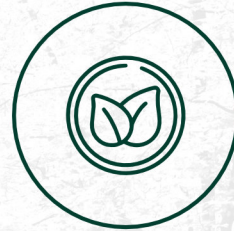
POLLUTION FREE ENVIRONMENT