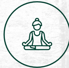
GREEN PARK FOR YOGA AND MEDITATION