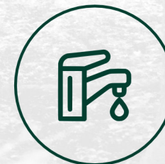
24X7 WATER SUPPLY