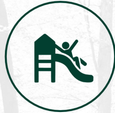
KIDS PLAY ZONE