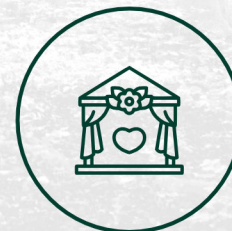
MULTIPURPOSE PARTY HALL