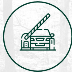
GATED TOWNSHIP WITH 24X7 SECURITY